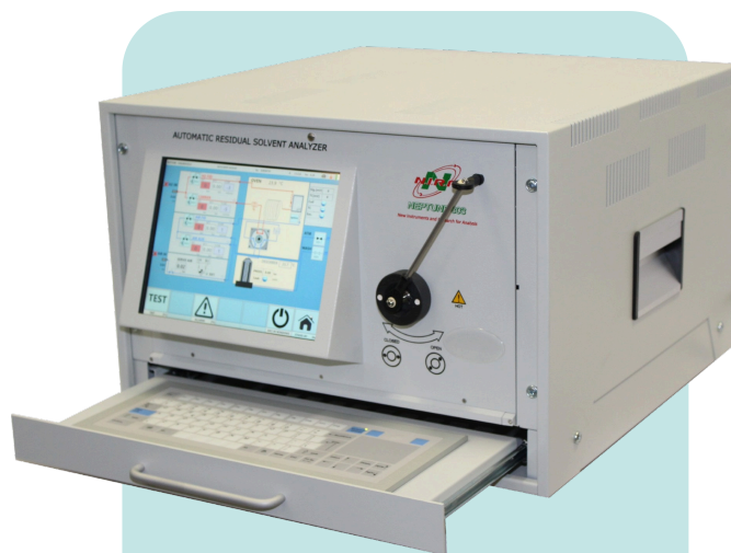
Front angle of the Neptune 803.