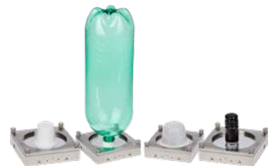
Bottles, cups, caps and more.

We offer a variety of cartridge options designed to fit a wide range of package types.