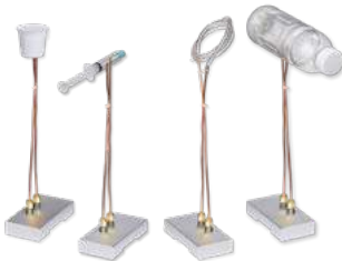
Whole packages, syringes, tubing and more.